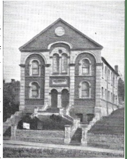
Raunds Methodist Church 1891