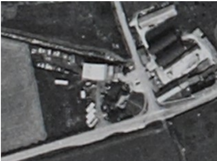
Cornerways Garage (LHS) Tithe Farm (RHS)