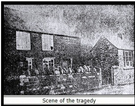
Scene of the tragedy